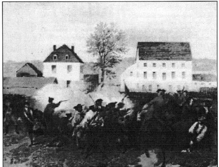
Minutemen meet Redcoats in the Battle of Lexington

Gentlemen may cry peace, peace — but there is no peace. The war is actually begun! The next gale that sweeps from the North will bring to our ears the clash of resounding arms! Our brethren are already in the field! Why stand we here idle? What is it that gentlemen wish? What would they have? Is life so dear, or peace so sweet, as to be purchased at the price of chains and slavery? Forbid it,